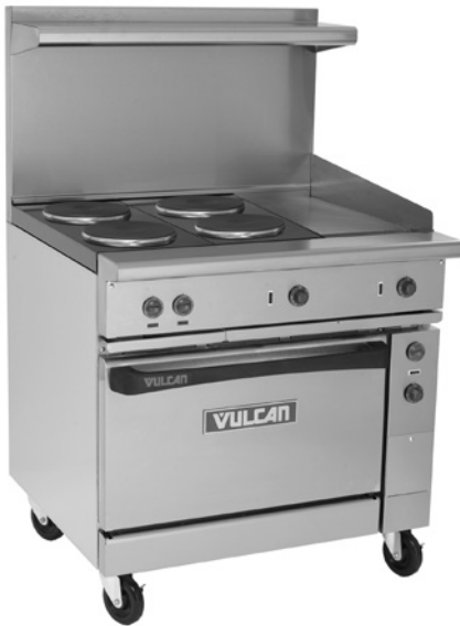
Model EV36-S-4FP-12G-208 shown with optional casters