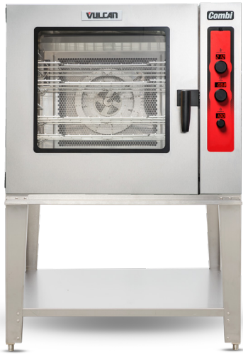
Model ABC7G Shown on stand